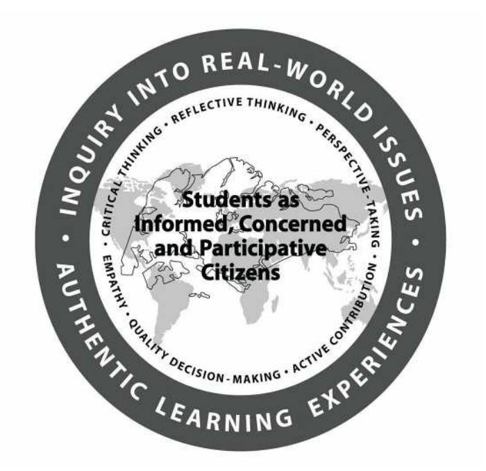
Figure 1.1 The Singapore Social Studies Curriculum